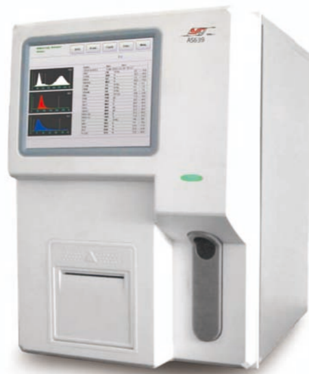
AS639 Hematology Analyzer